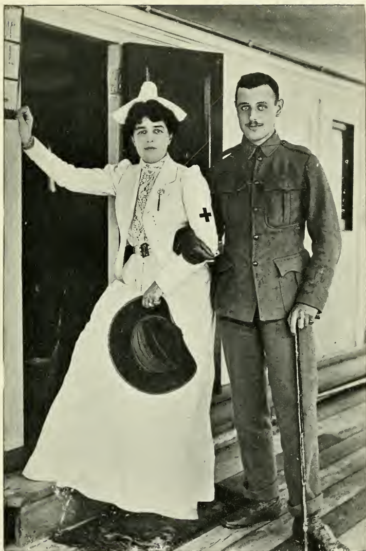
LADY RANDOLPH CHURCHILL AND MR. JOHN CHURCHILL ON BOARD THE "MAINE."